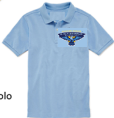
Tops: Gold or light blue polo